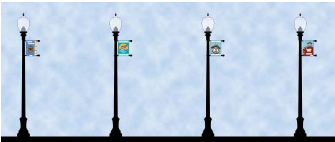
Banner Option A

In addition, the City completed the fabrication and installation of banners (shown below) throughout the CRA.