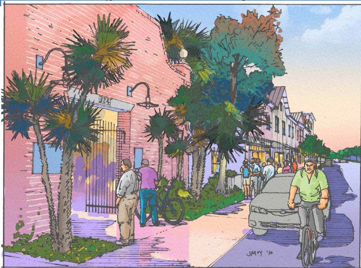
View of Downtown Gateway Tarpon Springs